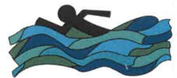
Things to do

Find out how your Local Offer can help you at: