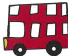
Travel & transport